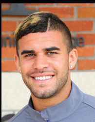
Dom Dwyer, Pro soccer, Orlando City SC