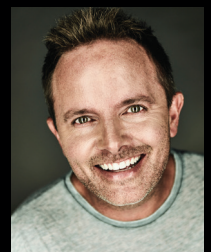
Chris Tomlin, Grammy-winning singer/songwriter