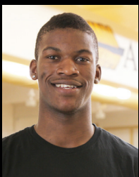
Jimmy Butler, NBA player, Olympic Gold Medalist

9 decades of exceptional graduates including Grammy and Academy Award-winners, actors, award-winning journalists, educators, business leaders, political figures and professional athletes.