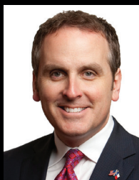
Bryan Hughes, State Senator