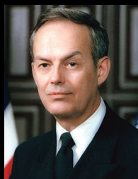
Bobby Inman, Admiral, U.S. Navy, (Ret.)